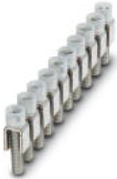
Fixed bridge, Number of positions: 10, Color: silver

Please be informed that the data shown in this PDF Document is generated from our Online Catalog. Please find the complete data in the user's documentation. Our General Terms of Use for Downloads are valid ( http://download.phoenixcontact.com )