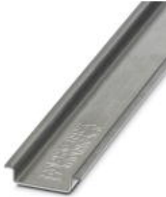
DIN rail, material: Aluminum, unperforated, height 7.5 mm, width 35 mm, length: 2 m

Please be informed that the data shown in this PDF Document is generated from our Online Catalog. Please find the complete data in the user's documentation. Our General Terms of Use for Downloads are valid ( http://download.phoenixcontact.com )