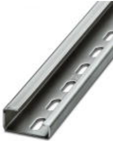
G-profile DIN rail, material: Steel, perforated, height 15 mm, width 32 mm, length 2 m

Please be informed that the data shown in this PDF Document is generated from our Online Catalog. Please find the complete data in the user's documentation. Our General Terms of Use for Downloads are valid ( http://download.phoenixcontact.com )