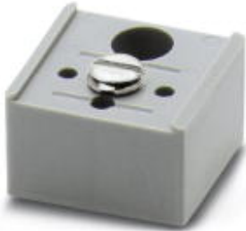
Support, for insulated mounting of DIN rails in insulated systems, plastic, 21 mm high

Please be informed that the data shown in this PDF Document is generated from our Online Catalog. Please find the complete data in the user's documentation. Our General Terms of Use for Downloads are valid ( http://download.phoenixcontact.com )