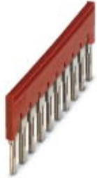
Plug-in bridge, Number of positions: 10, Color: red

Please be informed that the data shown in this PDF Document is generated from our Online Catalog. Please find the complete data in the user's documentation. Our General Terms of Use for Downloads are valid ( http://download.phoenixcontact.com )